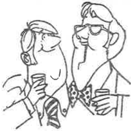
"Our church is very liberal: four commandments and six do-the-best-you-cans."