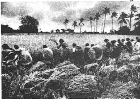
Women harvesting their first rice crop from their own land.