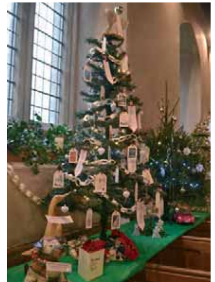
Stansted is Well Read