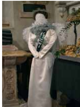
Stansted Evening W I