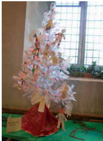
St John's Tots