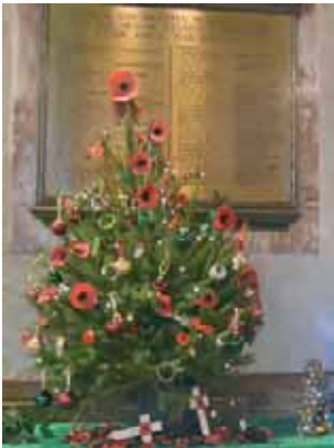
Royal British Legion