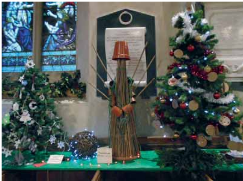
Huw Johnson Club and Mountfitchet Garden Club