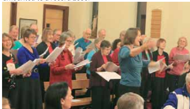
See more photos on our website www.stanstedchurches.com.