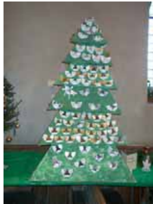
St Mary's School