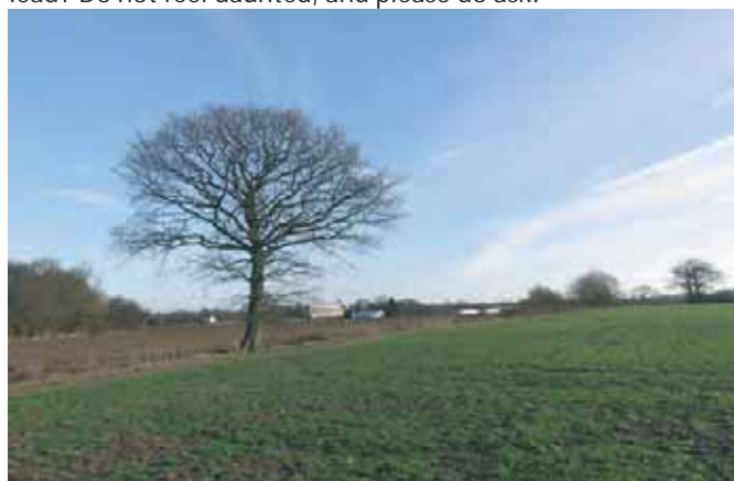
Photo of Birchanger on Boxing Day

AGM Saturday 18 th March 2.00pm Rhodes Centre Bishop's Stortford. BSDFA is 60 years old in March and there will be a display in the Rhodes Centre of walks undertaken over the years. The year 2016 encompassed an interesting series of walks from North Harlow through to Debden, almost all of which were held in excellent weather and so in completion of the calendar year on Boxing Day a stalwart group met up for a brisk walk from Stansted Mountfitchet over to Birchanger and Birchanger Wood, and indeed the weather was brilliant. This winter (at least in December), the weather has swung wildly between mild and warm days, dense and frozen fog days through to calm and mild ones. There were brilliant sunshine days and others when it was thoroughly cold, wet and windy. Interestingly, January, as I write is so far behaving very similarly. Notwithstanding, the Footpaths Association continues into 2017 with a varied set of walks in February and March, and we are now planning the spring/summer walks. Do you have a special walk to propose, or which you would like to lead? Do not feel daunted, and please do ask!