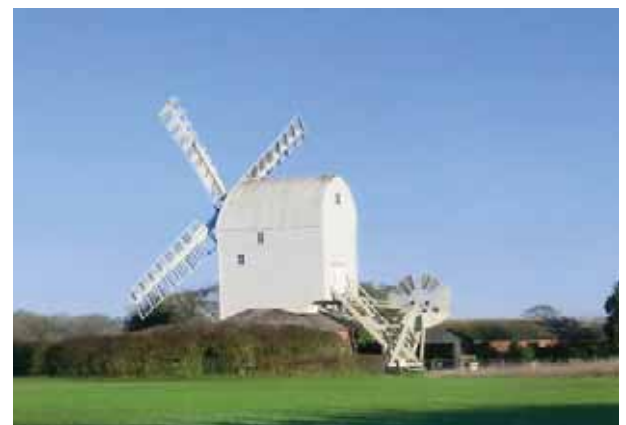
Aythorpe Roding is the last remaining Post Mill, in Essex. Built around 1770, it stopped working commercially in the early 1930s, but was restored to working order in 1982. Although now privately owned it is maintained by Essex County Council and is sometimes open to the public