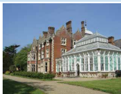
Hargrave House, Stansted: 01279 817272

Luxurious residential care home for retired, elderly or convalescent senior citizens.