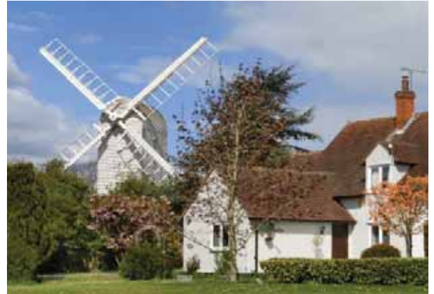
Another post mill can be seen in Finchingfield . This has a single storey round house and was built in the mid-18th century.