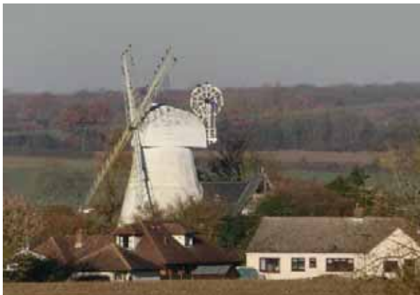
Gibraltar Mill, Great Bardfield was built as an experimental tower mill with exceptionally massive walls, completed soon after the sieges of Gibraltar, 1704-5. It was not successful commercially, and converted to a cottage. It was converted back to a mill in 1754 and then back to a private dwelling in 1934.